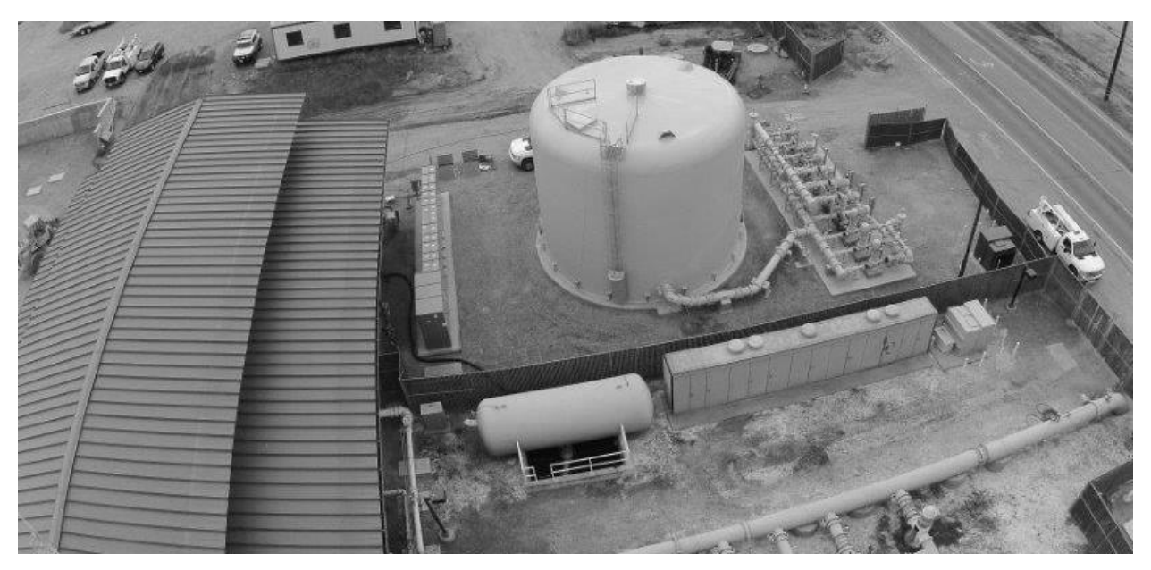
Lessalt Surface Water Treatment Plant Upgrade Construction