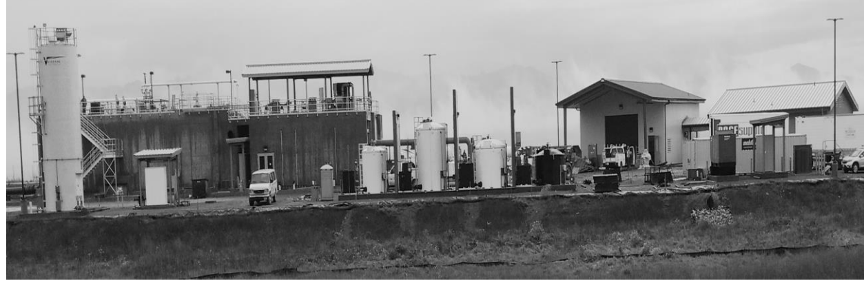
West Hills Surface Water Treatment Plant Construction