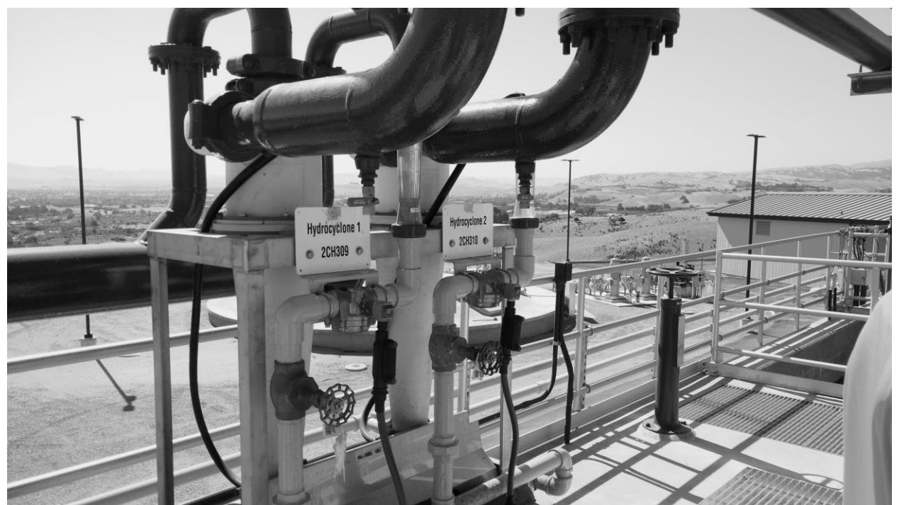
West Hills Surface Water Treatment Plant