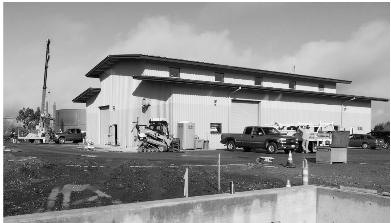
Lessalt Surface Water Treatment Plant Upgrade Construction